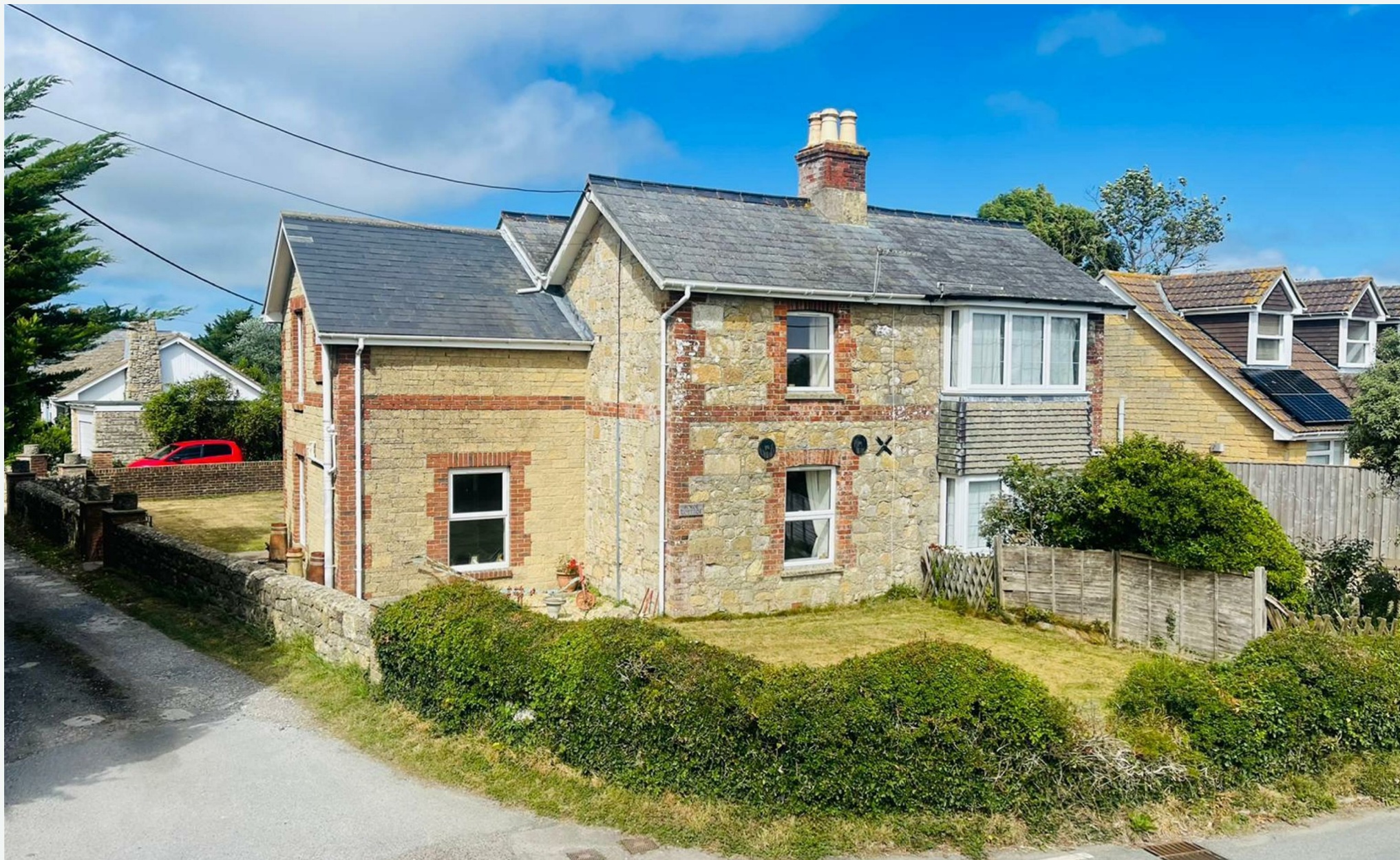
Forge Cottage, Thorley, Isle of Wight